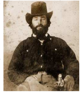
Br. Gen. John T Hughes